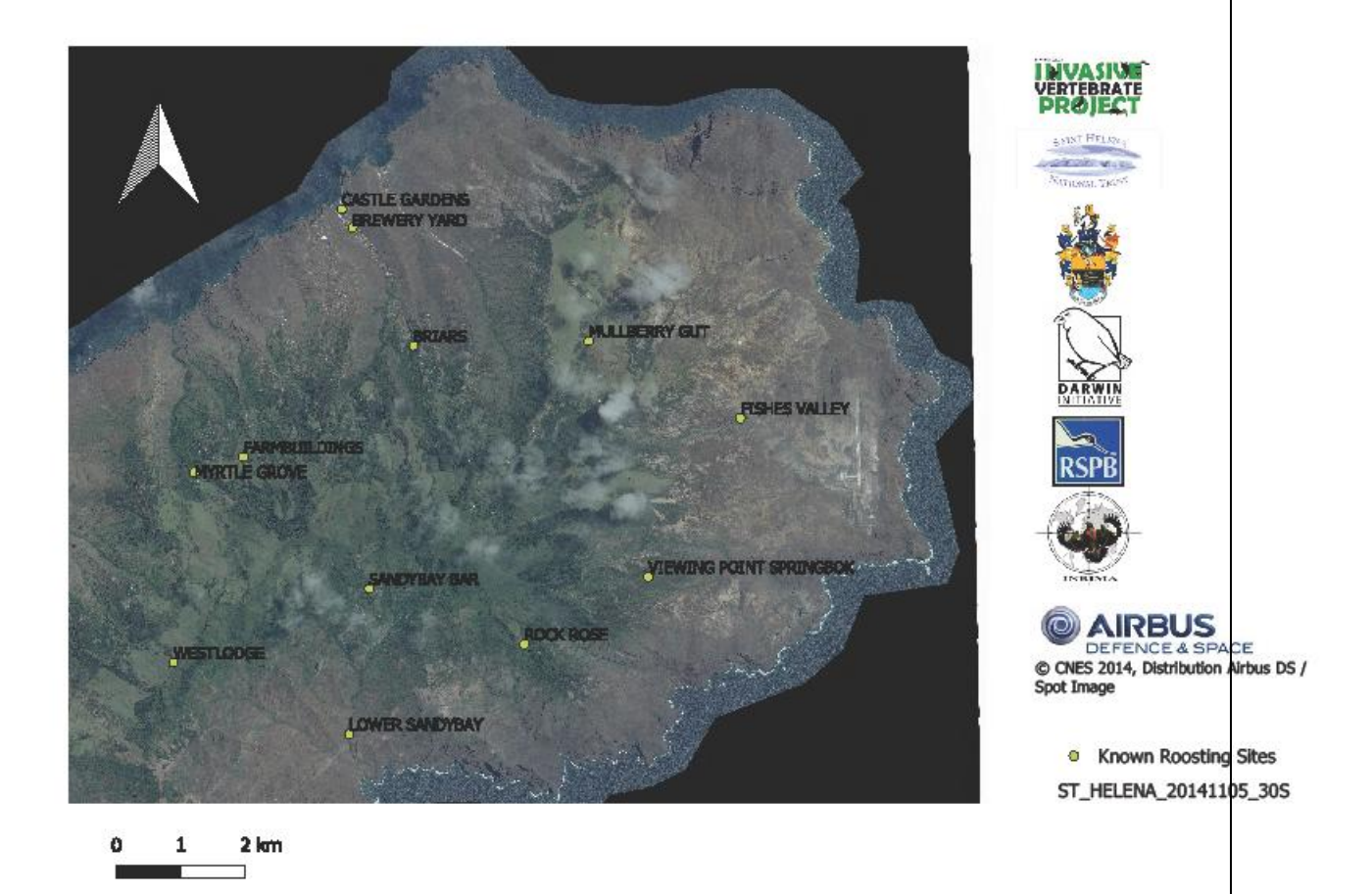
Figure 1: Map of Myna roosts

All original and confirmed Myna roost sites have been recorded with GPS and a map produced